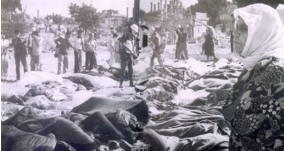
Figure 4: Deir Yassin Massacre 1948

These pictures are from Zionist massacres committed against unarmed civilian Palestinians. The bloody scenes and slaughtering of Palestinians were not a collateral damage, but rather they were organized atrocities which aimed to have a Zionist state in a Palestine that is ethnically cleansed from its indigenous people. They are the result of an orientalist and topographic efforts. Therefore, orientalist discourse is not merely an epistemic violence; it embodies itself as ethnic cleansing. Expulsion of Palestinians came with a detailed “Arabist” description of the methods to be used to forcibly evict Palestinians: intimidation, bombarding villages, setting fire to houses and demolishing them, planting mines in the rubble to prevent the expelled Palestinians from returning (Pappe 2006).