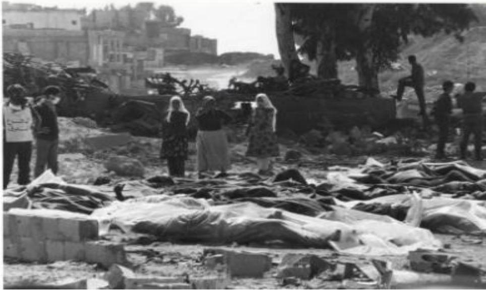
Figure 2: Qibya Massacre 1953