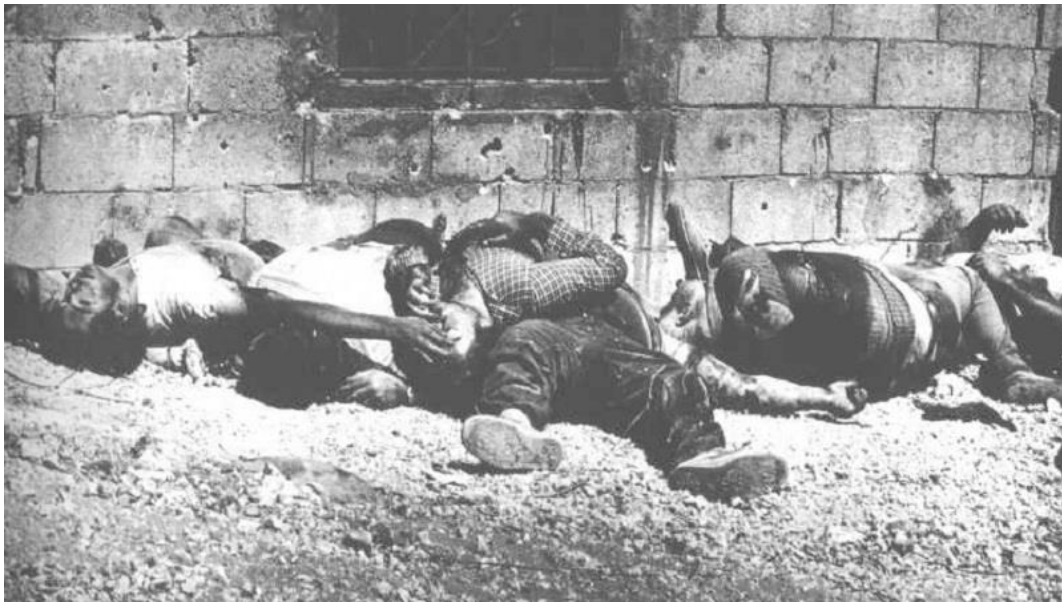
Figure 1: Abu Shusha Massacre 1948